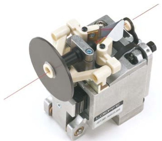
Long chromium spring brake