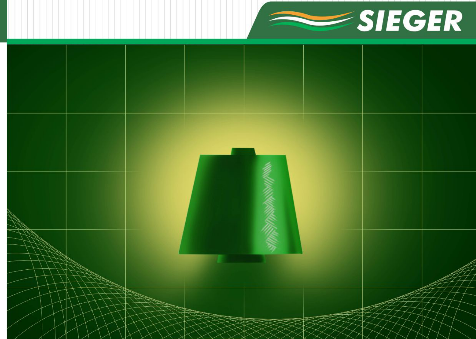
Yarn Conditioning Plant - YCP