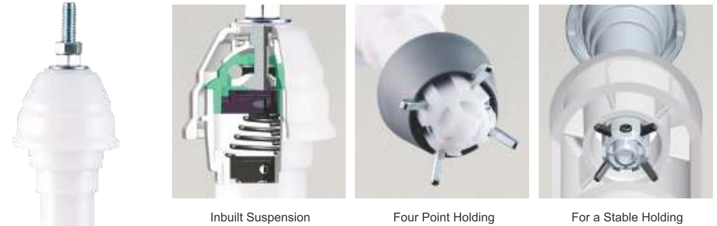
Inbuilt Suspension Four Point Holding For a Stable Holding

The new invention is intended to provide a Bobbin Holder for a stable holding and more a sophistication in loading and unloading of the roving bobbins and also to avoid the impact load to the creel structure. This featured Bobbin Holder of 4 Point Holding with Suspension System is suitable for any make of Bobbin Transportation System.