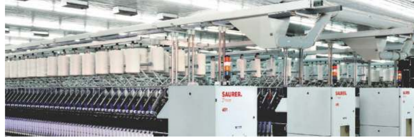
Autotex Bobbin Holder in Saurer Worsted Spinning Machine