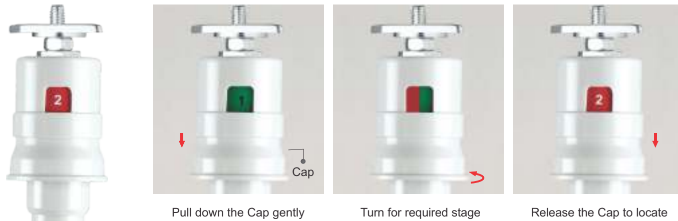
Pull down the Cap gently Turn for required stage Release the Cap to locate

Most of the spinning mills need to process various materials like cotton, synthetic, worsted and other blends of various hank and counts. The roving tension is also required to be provided accordingly. To fulfill this requirement, Autotex has invented a Bobbin Holder with Multi Brake System - MBS. In this Bobbin Holder the brake force can be selected as per the required processing parameters by a simple selection