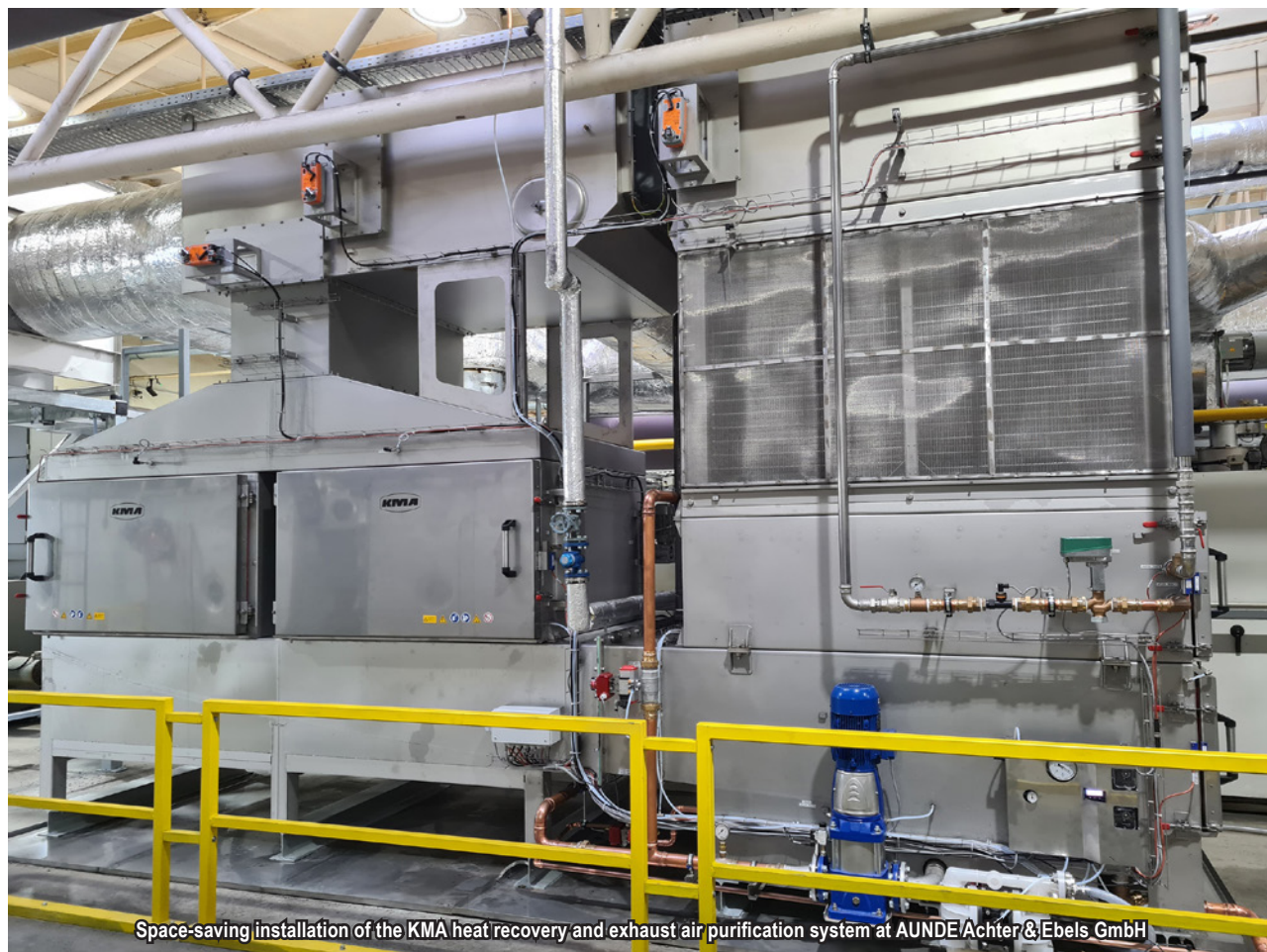
Space-saving installation of the KMA heat recovery and exhaust air purification system at AUNDE/Achter & Ebels GmbH

of production immensely. Therefore, operating costs are increasingly included in the overall consideration of the investment decision. In view of additional CO 2 levies due to emissions trading, reducing energy consumption will encourage more and more companies to rethink.